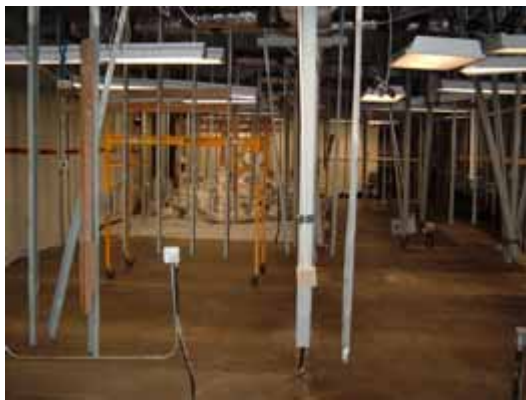
Construction underway, October 2006

The basement of Casterter Hall is in the process of being remodeled, with an expected completion date of August 2007. Asbestos abatement, begun in mid-August 2006, was completed by mid-September. The submission of 100% Construction Documents (see floor plan below) occurred in early October, and following a final review by the University, the bidding and awarding of a contract will proceed. Construction is expected to start in December. When completed, the 17,945 sq. ft. remodel will provide three lower-division laboratories, two upper-division laboratories, an advising center, a lab prep and support area, offices for instructors, and three lecture rooms. There will be a new west-side entrance to the basement. The courtyard will be accessible and made an attractive area for students, staff and faculty to congregate.