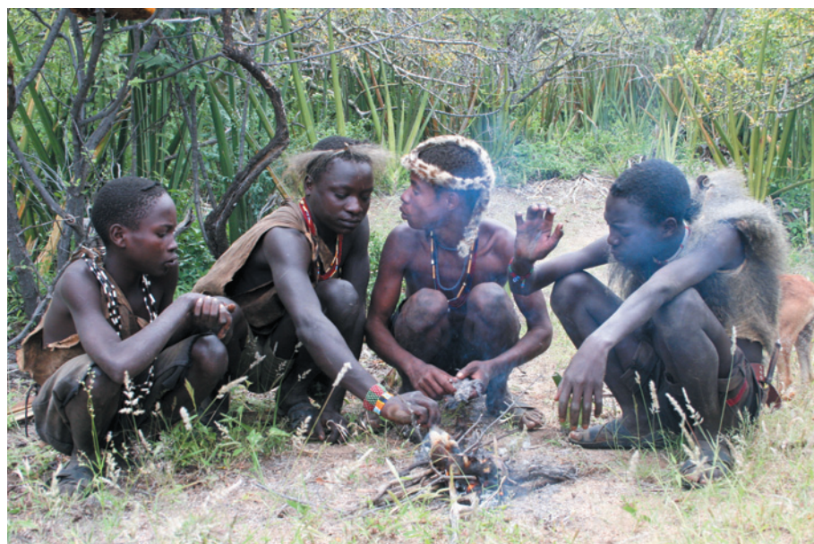
Figure 1 | Helping hands. The Hadza people of Tanzania, such as these young men who are roasting birds they have caught, rely on hunting and gathering to obtain most of their food. By studying Hadza social networks, Apicella et al. 4 illuminate the population dynamics that underpin the evolution of human cooperation.

To illuminate how the Hadza tackle the core dilemma of cooperation, Apicella et al. 4 gathered data on assortment and cooperative tendencies. The authors studied assortment within two social networks. To assemble the first (a campmate network), they asked adult Hadza from 17 different bands who they wanted to camp with when their next band formed. For the second network (a gift network), individuals received three honey sticks — Hadza love honey — and were asked to secretly specify who should get each stick. Finally, to measure cooperativeness, the researchers gave individuals from each band